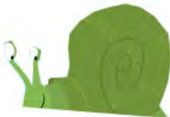
Illustration copyright © 2005 by Noah Z. Jones.