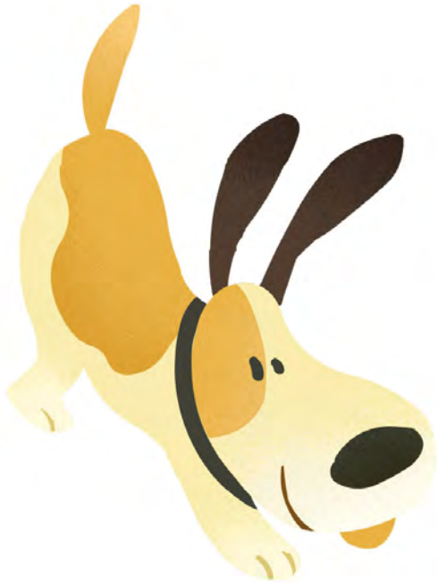
Illustration copyright © 2005 by Noah Z. Jones.