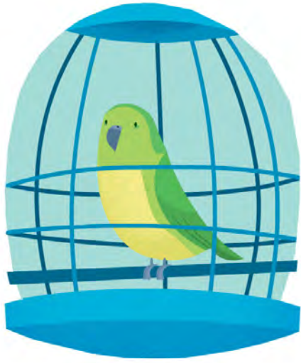
Illustration copyright © 2005 by Noah Z. Jones.