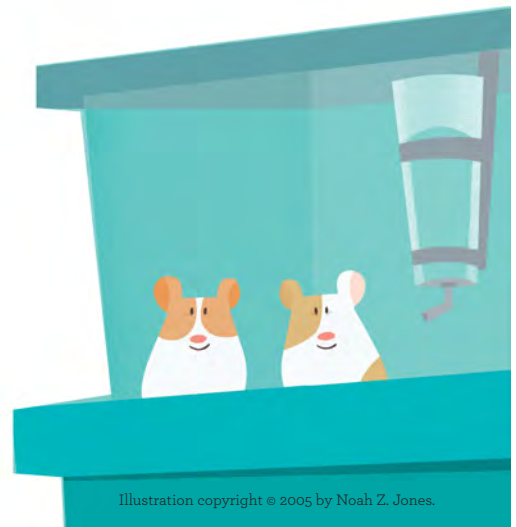
Illustration copyright © 2005 by Noah Z. Jones.